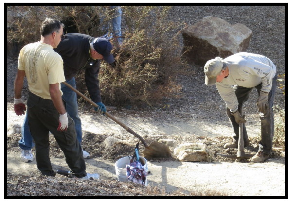
Volunteers working at Stadium Lane.

The Bill Shepard Botanical Garden received a needed sprucing-up recently on an ALPSsponsored workday. The approximately ten volunteers constructed a rock wall at a lower switchback to lessen trail degradation, dressed trails to bolster their edges, spread wood chips around plants, watered plants, and painted three wooden benches along the ALPS Trail leading into Stadium Park. If you haven't visited Stadium Park recently, take a hike starting at the Botanical Garden and continue into the park. The park hiking offers beautiful views of downtown Atascadero and the surrounding area, and it's just three blocks from the Atascadero city hall!