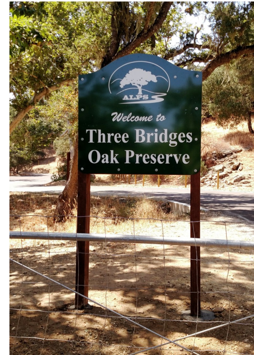
Entrance sign at Three Bridges Oak Preserve trailhead.

Besides the beautiful landscape, great trails and amazing view from the top, ten large interpretive signs were installed at kiosks and free standing pedestals. In addition, more than a dozen small interpretive signs have been installed along the trails. These signs provide trail users with interesting information about the project, local history, watershed, habitat and resident flora and fauna.