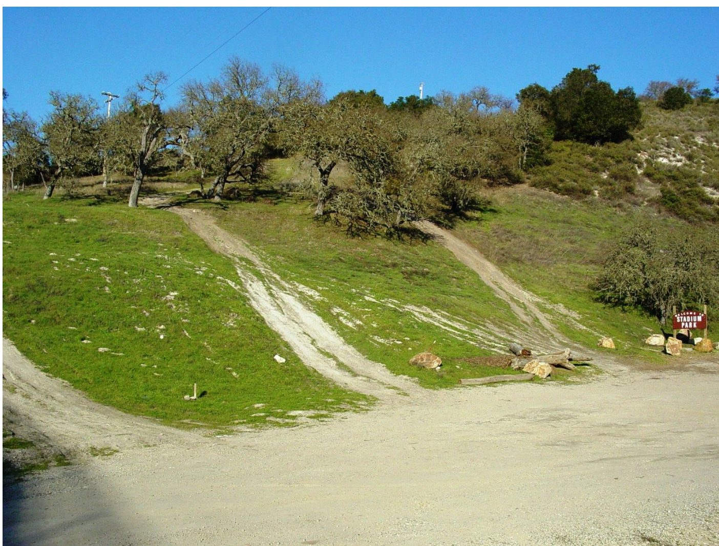
Stadium Lane in February 2006