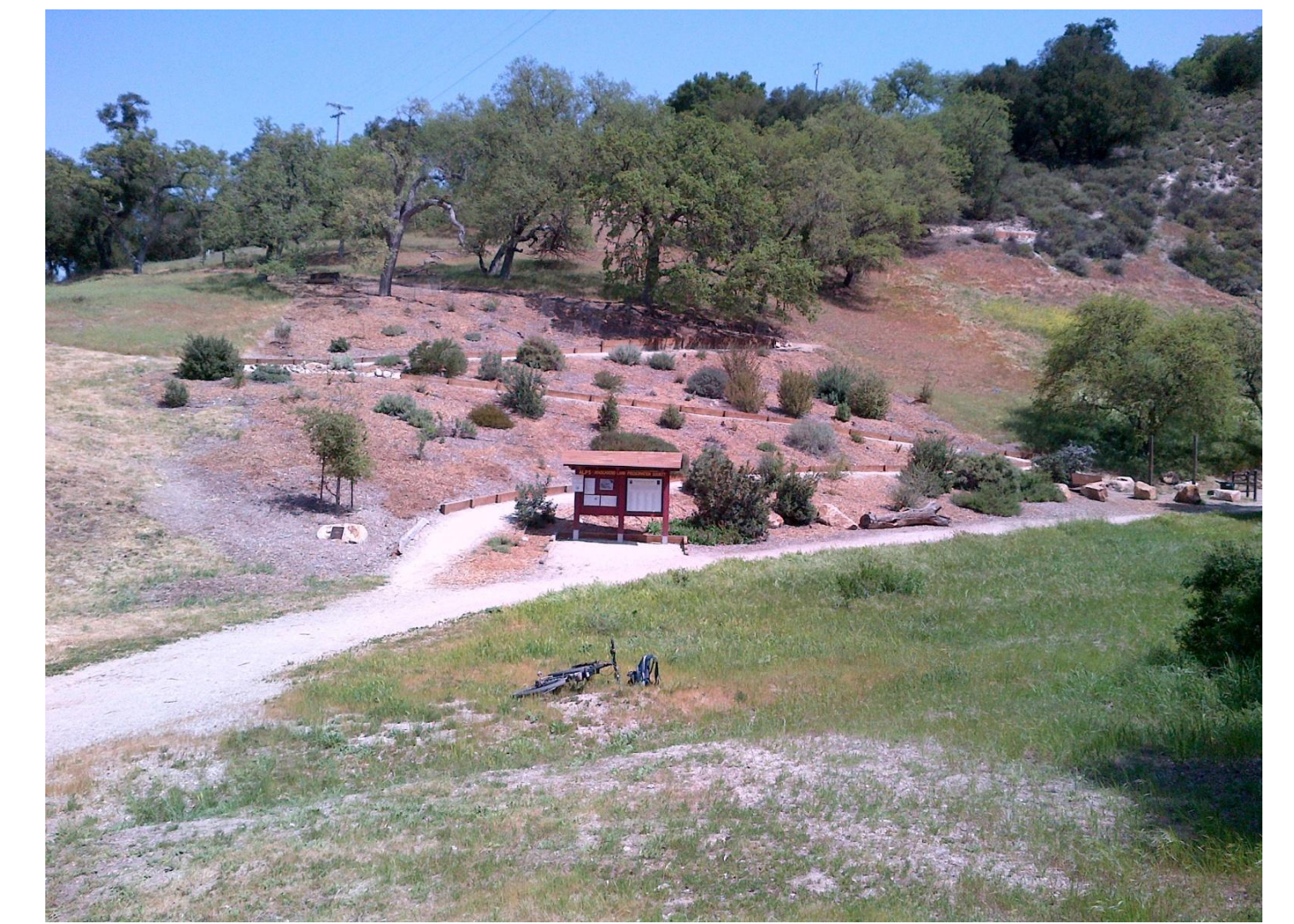
Stadium Lane in September 2011

The Atascadero Land Preservation Society (ALPS) is a local, non-profit, 501(c)(3) conservation organization founded in 1989 whose mission is to preserve environmentally significant open space and natural land located in Atascadero, California.