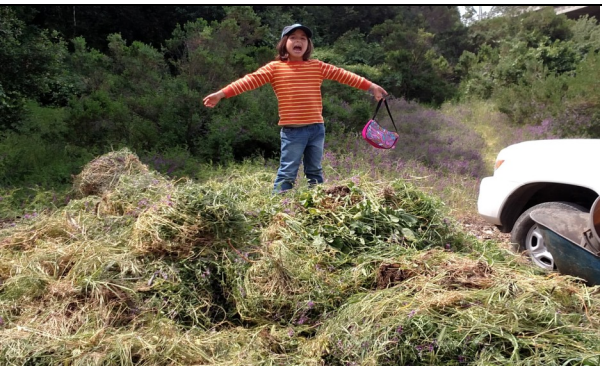
A young helper from Atascadero Helpers standing on the large weed pile. She proclaimed herself “The Queen of the Weeds”!