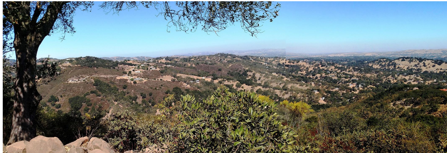
Vista from top of Three Bridges Oak Preserve

Atascadero Land Preservation Society Saving Open Spaces