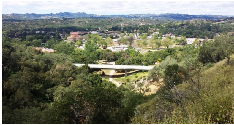
Vista from top of the ALPS Trail at Stadium Lane