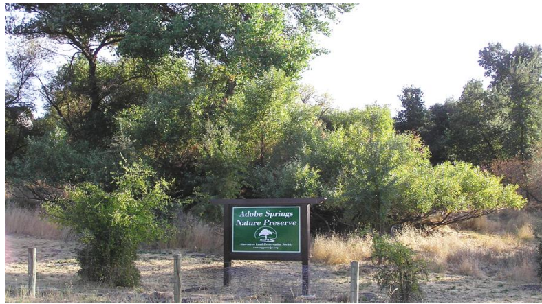
Adobe Springs Nature Preserve sign located along Traffic Way

Adobe Springs Nature Preserve includes five acres with year-round seeps and a spring that harbors native willow, sycamore, oak, and cottonwood trees and is home to many native animals. The Preserve is not open to the public. Docent led tours are available upon request. Nearby is the site of the Estrada Adobe built in 1812 as an outpost of Mission San Miguel.