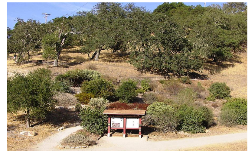
Stadium Lane kiosk and the Bill Shepard Native Plant Garden

Stadium Lane is comprised of five acres at the entrance to Stadium Park, a native woodland park with a rich local history located within two blocks of Atascadero's city center. It showcases the Bill Shepard Native Plant Garden which visitors can enjoy before entering the trail system of the main park. An informational kiosk highlights the park history and the garden along with tips on native plants that grow well in the Atascadero area. The ALPS Trail switchbacks through the garden and up the hillside providing a scenic view of downtown. The Marj Mackey Trail parallels the access road going into the bowl. Both trails lead to the 74 acres of the City owned Stadium Park which offers great hiking, biking and equestrian trails for all users. The park offers a quiet respite for busy city workers and a venue for exercise. The park is open from dawn to dusk. Dogs are allowed on leash.