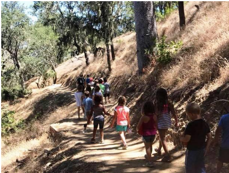
Three Bridges Oak Preserve Oak Woodland Loop Trail

Three Bridges Oak Preserve consists of 103 acres and three miles of multi-use trail on the west side of Atascadero. The unique north facing slope showcases four different habitats that include riparian, oak woodland, chaparral and coastal mountain ecologies. The trail accommodates hikers, bikers and equestrians. Dogs are allowed on leash. The preserve features informational kiosks and signage focusing on the preserve's native flora and fauna and unique features. Trailhead access is off of the western most section of Carmelita Avenue. Directions to the trailhead, trail maps, and informational signage can be downloaded from the ALPS website. The Preserve is open from sunrise to sunset, seven days a week. The preserve is closed during periods of high water in Atascadero Creek. Check website for status.