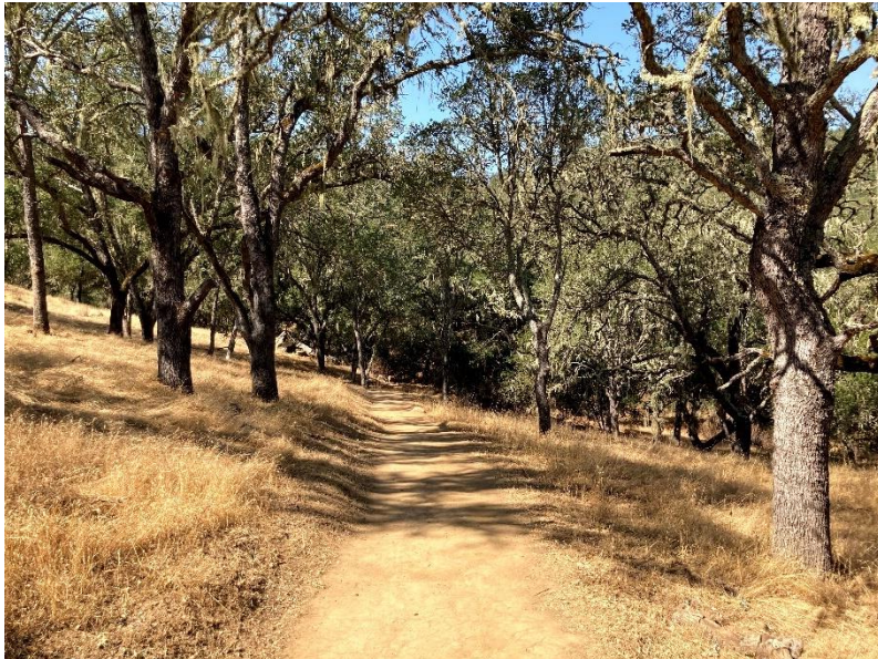
Trail on Three Bridges Oak Preserve

Three Bridges Oak Preserve is ALPS' largest property showcasing native oak species within a 103-acre site on the west side of Atascadero. Users will enjoy the preserve's four different habitats within the limited three-mile multiuse trail system on the preserve. The trail accommodates hikers, equestrians, and mountain bikers and features informational signage on native flora and fauna. Dogs are allowed on leash. Access is from trailhead parking off Carmelita Avenue approximately two miles west of city center near highway 41. Directions to the trailhead, trail maps, and informational signage can be accessed from the ALPS website.