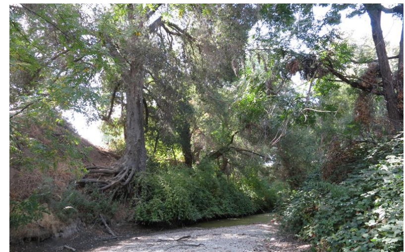
Atascadero Creek Reservation property

ALPS monitors eleven acres of Atascadero Creek streambed and adjoining easement on the east side of Atascadero. The creek is one of the few upper Salinas tributaries with documented steelhead in an urban setting. ALPS works to preserve, protect, and promote the creek in its native state. There are no tours to this property to maintain the creek in its natural state as much as possible.