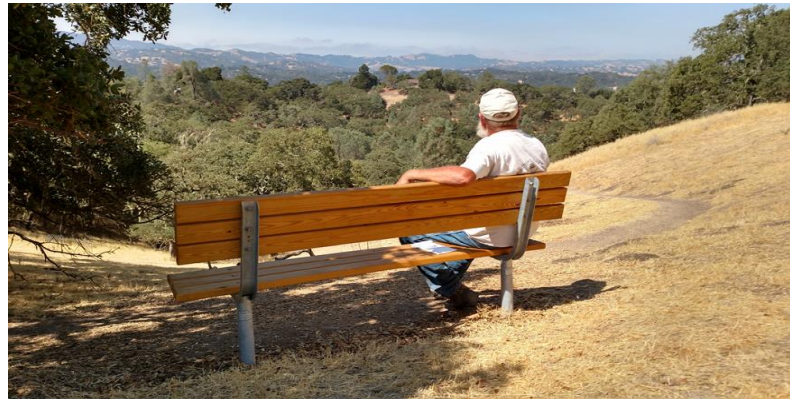
Vista along Stadium Lane trail