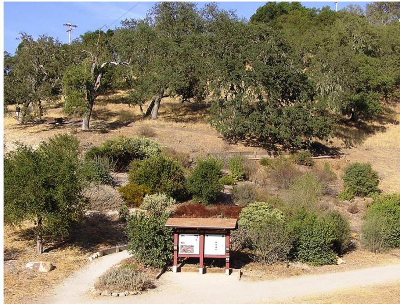
Stadium Lane with Bill Shepard Native Plant Garden

Stadium Lane comprises five acres at the entrance to Stadium Park, a native woodland park within two blocks of Atascadero's city center. It showcases the Bill Shepard native plant garden which visitors can enjoy before entering the trail system of the main park. This park offers great hiking for families, a quiet respite for busy city workers, and a venue for exercise.