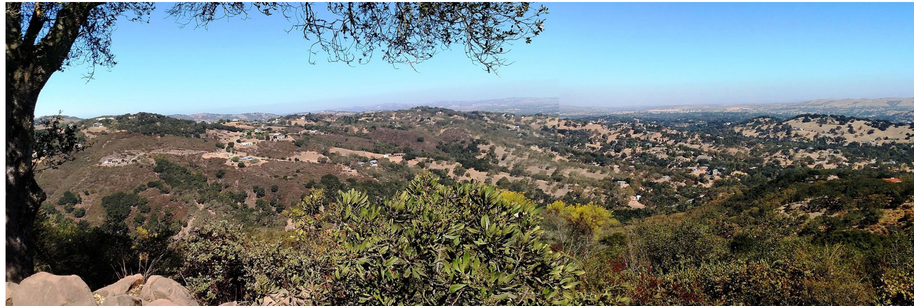
Three Bridges Oak Preserve outlook vista