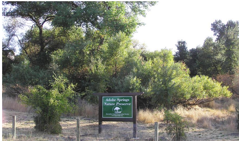
Adobe Springs meadow leading into spring and wood-land area

Adobe Springs includes five acres with year-round seeps and springs harboring native willows,